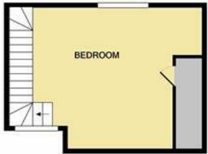
2ND FLOOR APPROX. FLOOR AREA 265 SQ.FT. (24.6 SQ.M.)